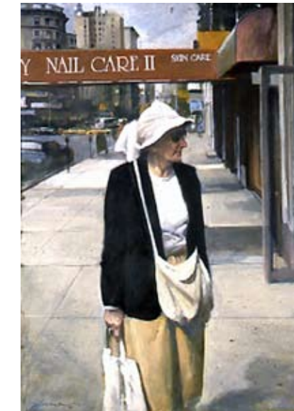
Burton Silverman (American, b. 1928). Nail Care , 2003. Oil on linen. 27 in x 19 in.

Funding provided by Astoria Federal Savings