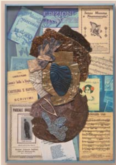
B. Amore. Heart of Naples/Hands of New York , 2011. Streetmade paper, gloves, found objects, sheet music images. 22.5 in. x 32.5 in. x 2.25 in.

Presented in conjunction with the Hofstra Cultural Center conference Delirious Naples: For a Cultural, Intellectual and Urban History of the City of the Sun, November 16–18.