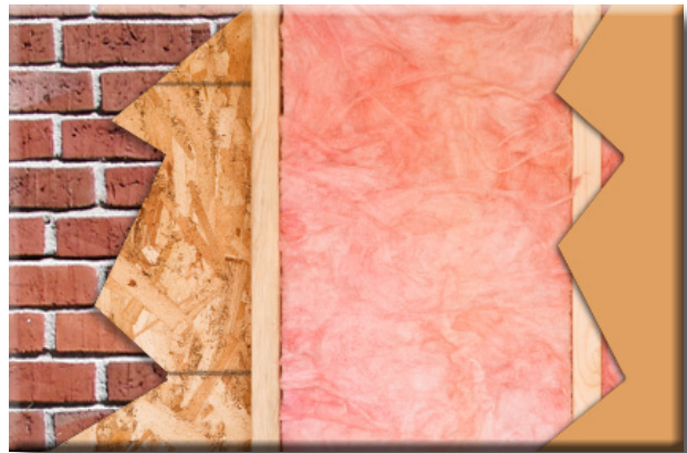
Figure 1: Insulated wall consisting of (from outside in); brick, plywood, 2X6 framing, fiberglass insulation, and drywall

In the prior KSB, you learned that the formula that you use to calculate the rate of heat transfer from hot to cold is Q = kA (\Delta T) / L . You remember that one of the factors that influences the rate of heat flow is the thermal conductivity of the material that is being used as a conductor or an insulator of heat. Normally, the outside surfaces of our houses or apartment buildings are made from more than one type of material. A wall, for example, can be made from sheetrock (plasterboard) on the inside, brick and plywood on the outside, and some kind of insulation, perhaps fiberglass between the inside and outside surfaces (Figure 1).