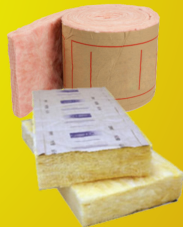
Figure 2: Roll of insulation (top), batts* of insulation (bottom)

*A batt is pre-cut strips of insulation available in various widths