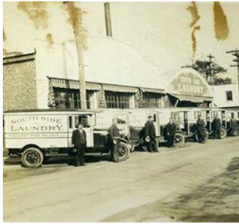
Drivers standing alongside their trucks in front of South Side Laundry, Walter's Laundry, Inc., c.1930s

The Robert David Lion Gardiner Foundation has funded eight individual Long Island Studies Institute projects. Included among them are the processing of the Hart Nichols Collection, 1730-1930 (70 cubic ft.); the creation of the Long Island Business and Industry Catalog, which contains information regarding forty-three collections that include materials pertaining to the history of business and industry on Long Island; and the completion of six student research projects in the form of online exhibits.