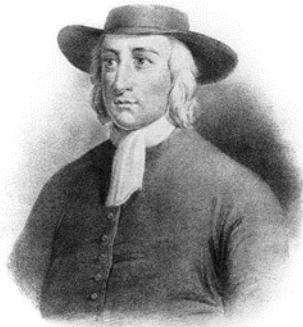
Illustration of George Fox, founder of the Quaker movement

See also: Finding aid for the Frank Buck Collection