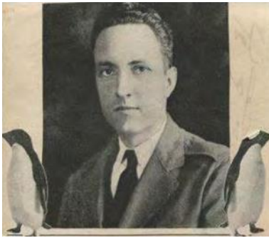
A rare image of Frank Buck as a young man.