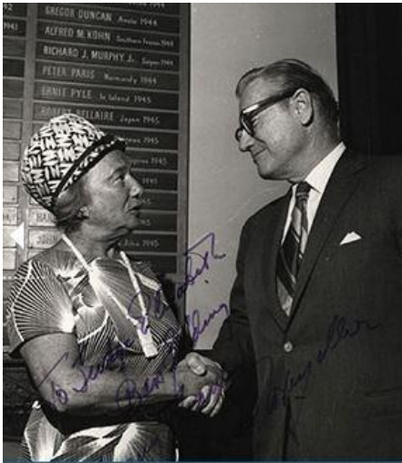
Judge Golding with Governor Nelson Rockefeller